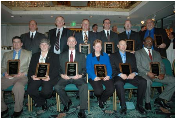
District Athletic Directors of the Year