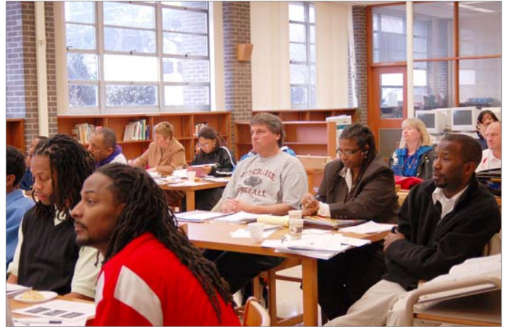
Baltimore City Athletic Directors participating in the NIAAA Professional Outreach Program.

Go to the NASPAA website www.naspaa.net and review the information.