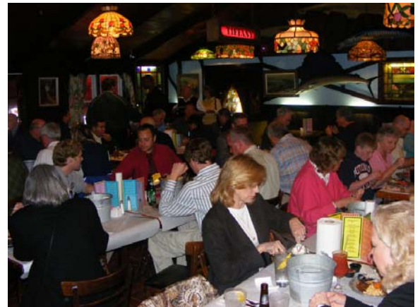
Everyone enjoying the Phillips Seafood Buffet