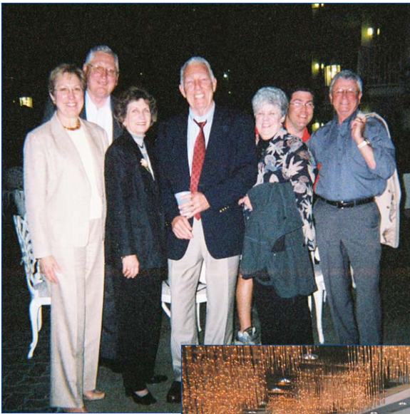
Enjoying the Hospitality Room