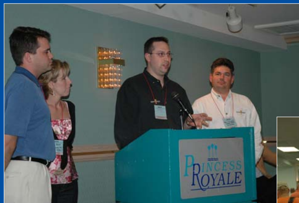
MSADA Corporate Sponsor, Crown Trophy