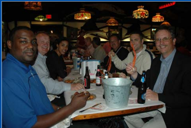
Enjoying the Phillips Seafood Buffet