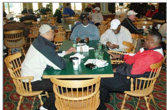
The 19th Hole!