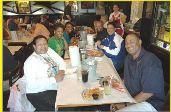
Our friends from Prince George's County.