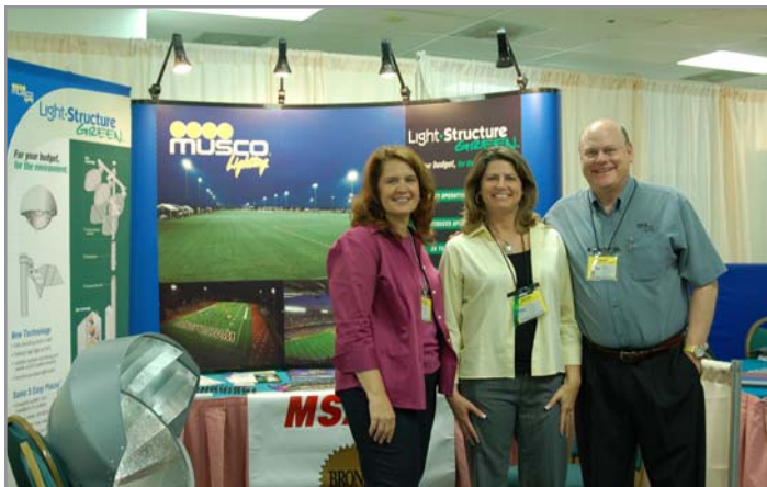
Bronze Sponsor Musco Lighting