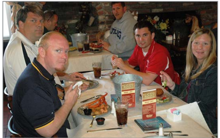
Some of the folks from Delaware