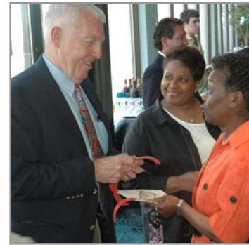
Now you promise my ticket will win?