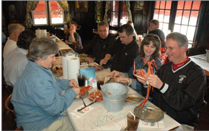
How do you eat this?