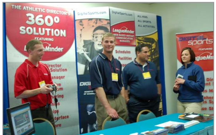
Gold Sponsor Digital Sports